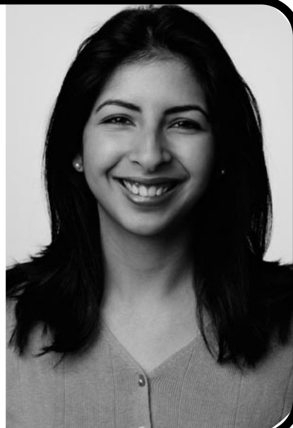
Your Ad / Her Response (2) 0704035 D/I-V