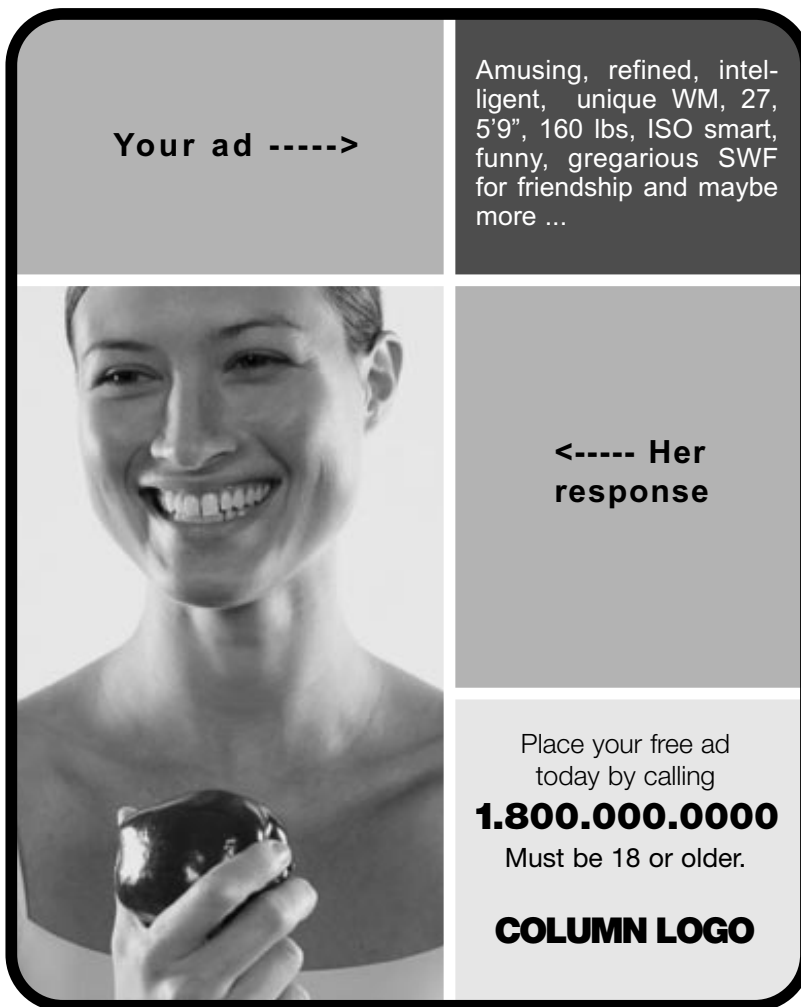
Your Ad / Her Response (1) 0704032 D/I-V