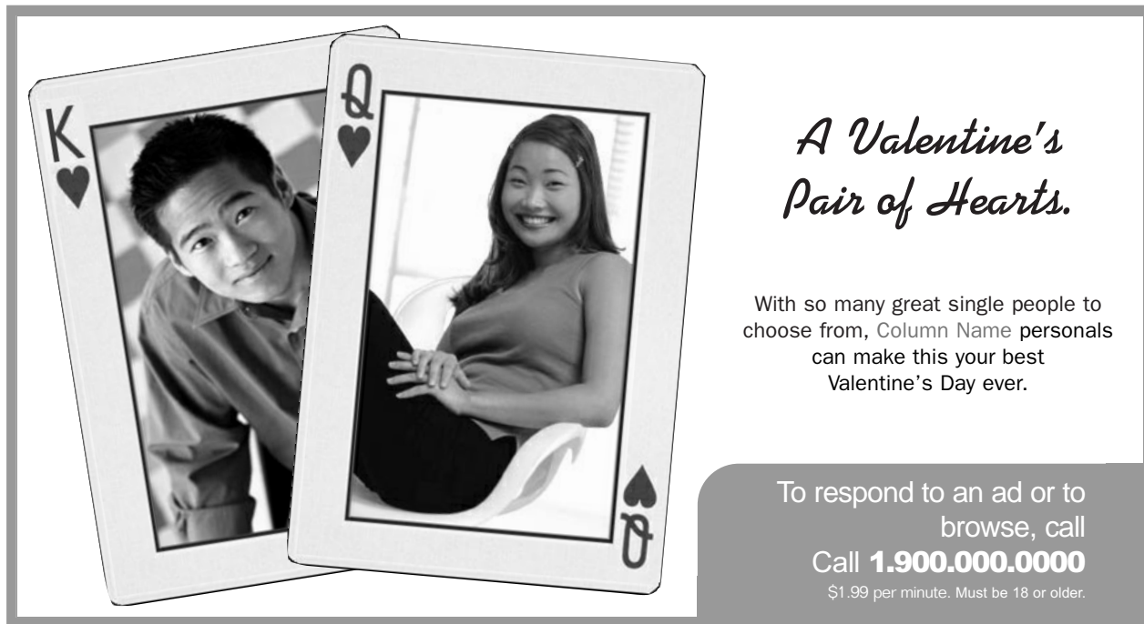
Feb. Pair of Hearts 0206012 D/I-H