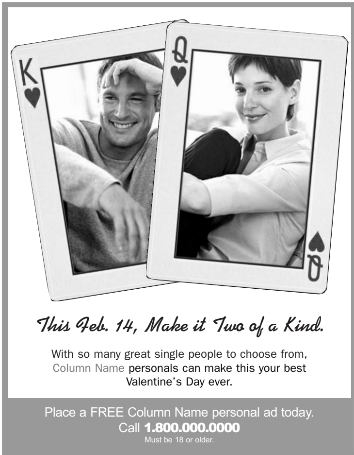
Feb. Two of a Kind 0206011 D/I-V