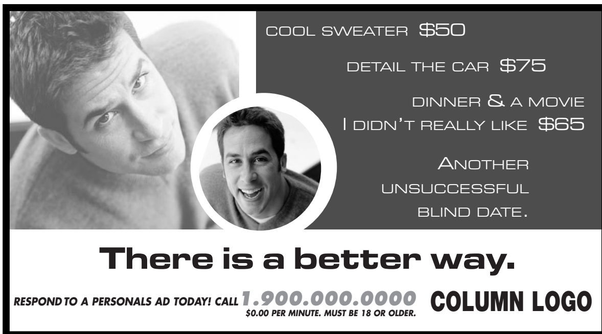
"Sweater" 0508017 D/I-V