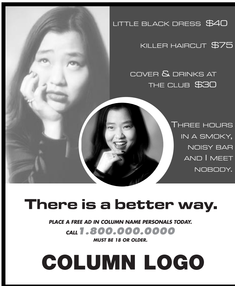
"Black Dress" 0508016 D/I-V