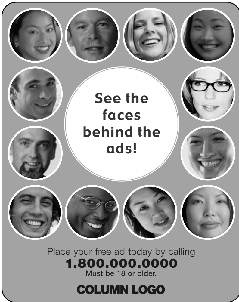
August / See the Faces (3) 0804034 D/I-V