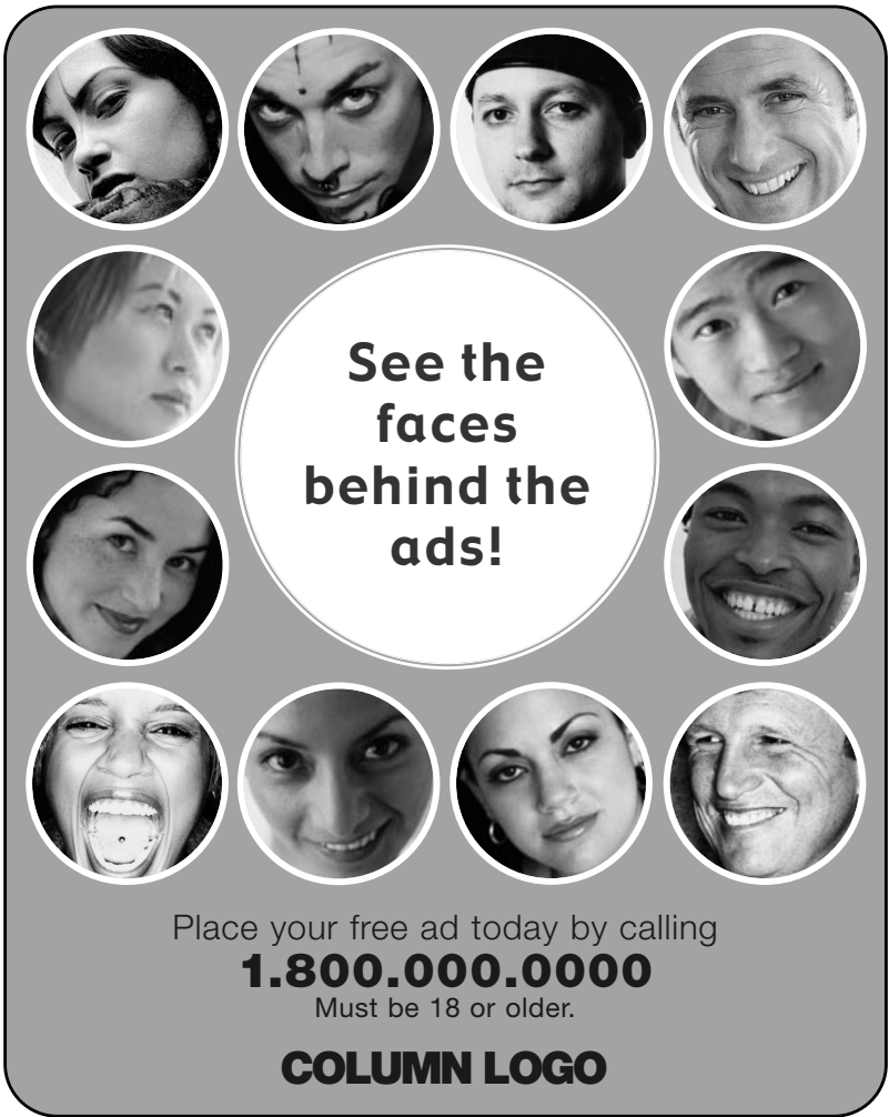
August / See the Faces (1) 0804032 D/I-V